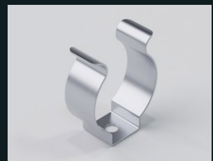
Terry Clip UA10735