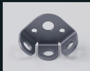
End Cap - Three Way UA12080