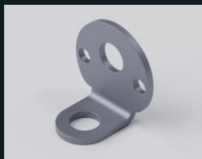
End Cap - One Way UA18036