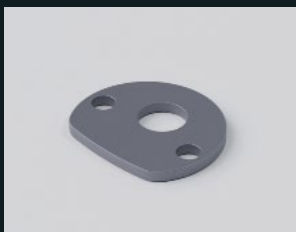
End Cap UA10733