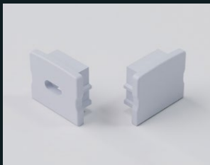
End Cap Set UA38866 - ENDCAPSET