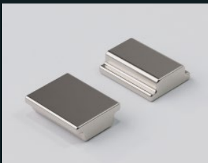
Mounting Magnet UA42407-MAGNET