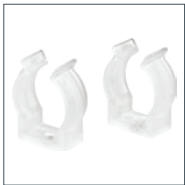
Plastic Terry Clip - Clear U-NEON-R22B-BRK